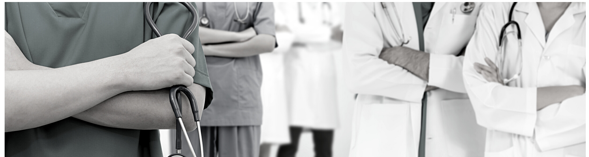
Our talented clinicians and medical students trained to perform top-notch annotations Medical annotation experts